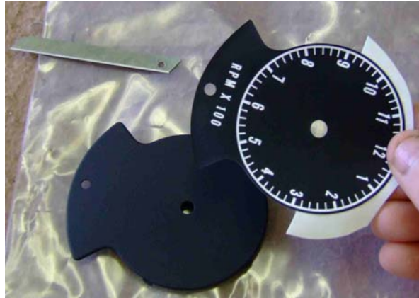
FIGURE 2 – Typical Installation technique using decal backing as a “handle” (B body tic toc clock shown)

some gauges having a small locator hole in different spots. This will also help you select the correct face for the gauge.