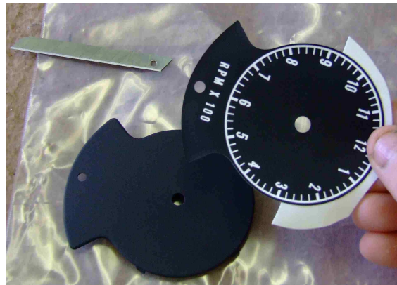
FIGURE 3 – Typical Installation technique using decal backing as a “handle” (B body tic toc clock shown)