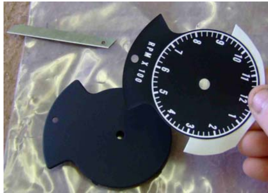
FIGURE 3 – Typical Installation technique using decal backing as a “handle” (B body tic toc clock shown)