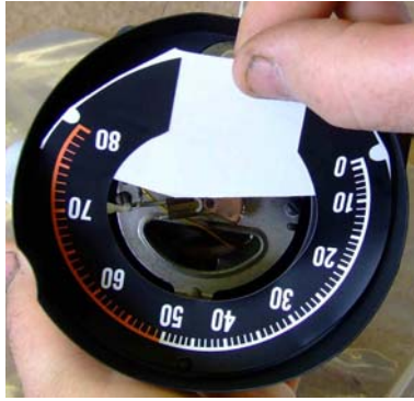
FIGURE w – Typical Installation techniques using decal backing as a “handle” (B Body Tic Toc Tach shown in this example)